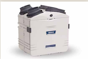
Heat Recovery Air Exchanger