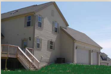
3 Car Garage on Two Story Homes