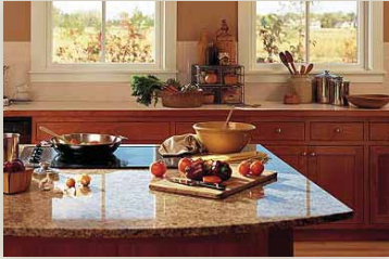
Granite Kitchen Counters