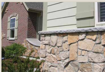
Stone Exterior per Elevation