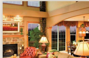
All Painting and Staining