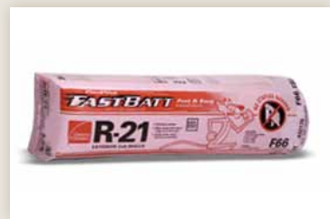
R-50 & R-21 Insulation