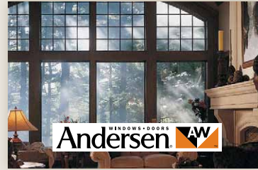
Andersen Wood Windows