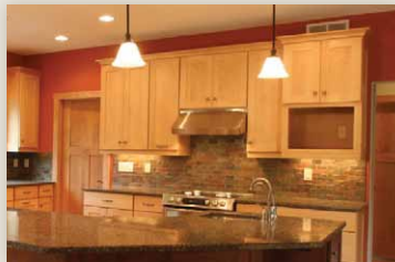
Cabinets featuring full extension, dove tail and quiet close drawers along with roll out shelving