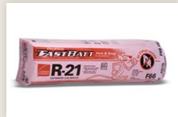
R-50 & R-21 Insulation