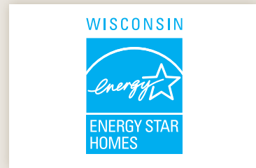
Energy Star Homes