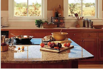
Granite Kitchen Counters