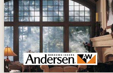
Andersen Wood Windows