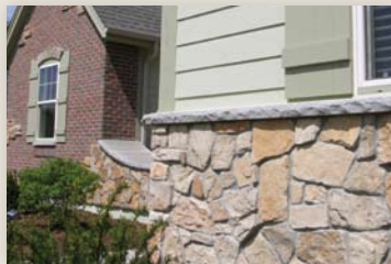
Stone Exterior per Elevation