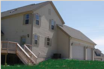
3 Car Garage on Two Story Homes