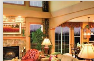
All Painting and Staining