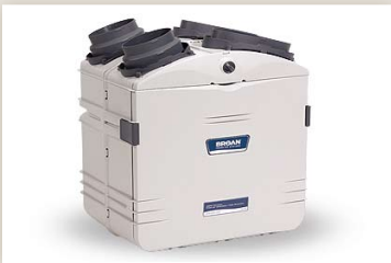
Heat Recovery Air Exchanger