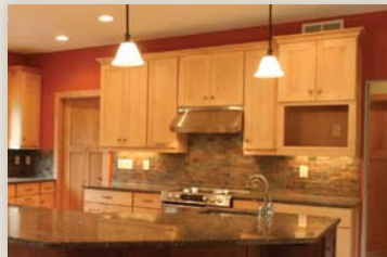
Cabinets featuring full extension, dove tail and quiet close drawers along with roll out shelving